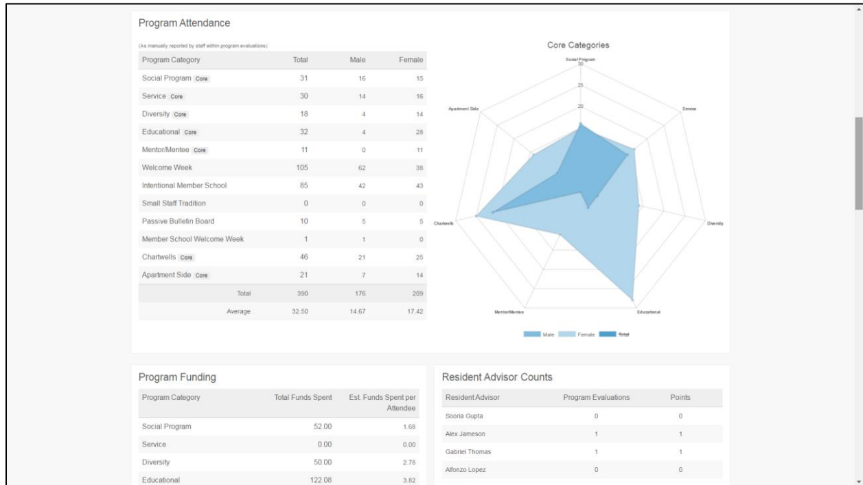
Figure 2 - Another screen capture of the Programming Pulse Report, showing statistics for program attendance, program funding, and Resident Advisors performance.

At the top of the Pulse Report, quickly view the approval flow of Program Proposals and Program Evaluations. Across your categorical programming model, view the distribution of approved programming evaluations.